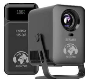
Off-grid Video projector (with powerbank)

Selection / Creation of linguistically relevant multimedia contents