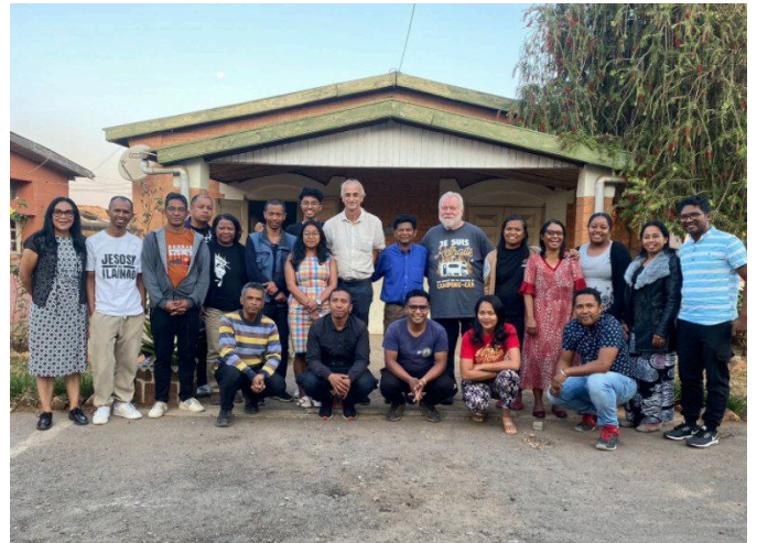
With some members of the team from the Script Union of Madagascar

We are very happy to collaborate with the Script Union of Madagascar, which has translated some 170 children's stories into Malagasy, and is very active, even proactive! Let us keep them in our prayers, as some team members are facing challenges in many areas.