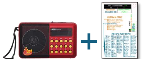
Standard MP3 player (available on markets all around the world) Table of contents card