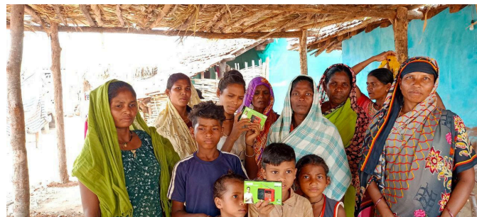
Distribution of Audio Vie players in Punjab, an unreached region in the northwest of India where the main religion is Sikhism.