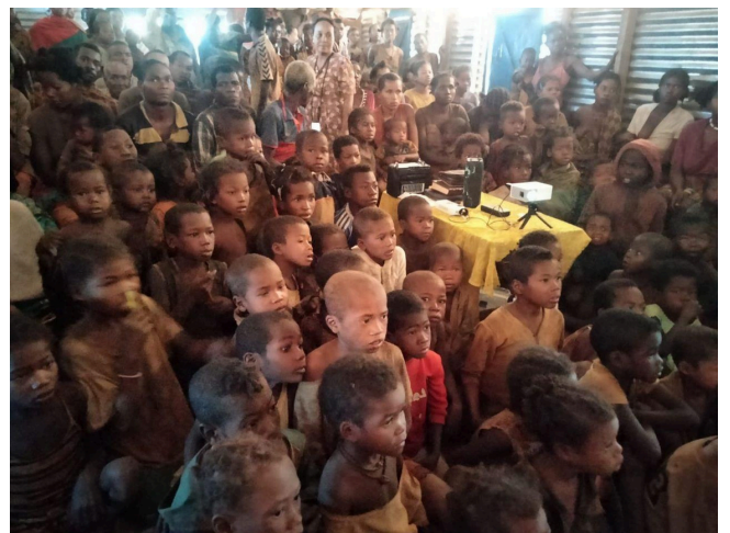
Projection of an evangelistic film in the Mikea language